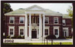
INTENTION TO DESIGNATE 2003