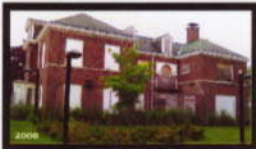
HERITAGE DESIGNATION FEB. 2009