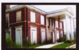
APPLICATION TO REPEAL DESIGNATION AND DEMOLISH MARCH - MAY 2009