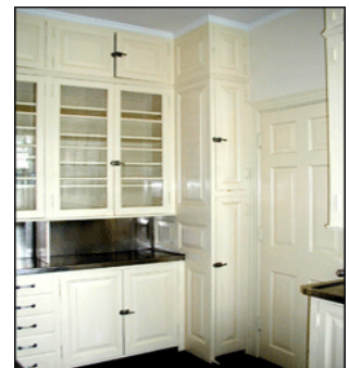
A look inside... the O'Connor Irish Heritage House

For more information please visit www.IrishHeritageHouse.com or email us at info@irishheritagehouse.com