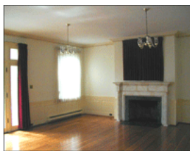
A look inside... O'Connor Irish Heritage House.

*PLEASE MAKE A NOTE ON THE CHEQUE MEMO: "O'Connor Irish Heritage House"