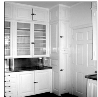
A look inside the O'Connor

<< This interview can be found on video on our website: www.irishheritagehouse.com >>