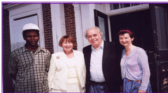
Daytime Toronto - Rogers TV Interview

Be part of the plan - be part of the action - be part of the legacy.