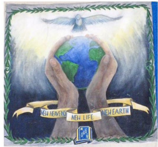
(above) Mural by Students of Senator O'Connor College School Jubilee Year 2000